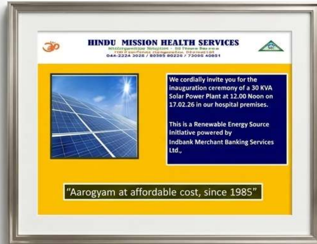
Formal inauguration ceremony held on 17.02.26 at 12:00 Noon, marking the official handover of the renewable energy initiative.