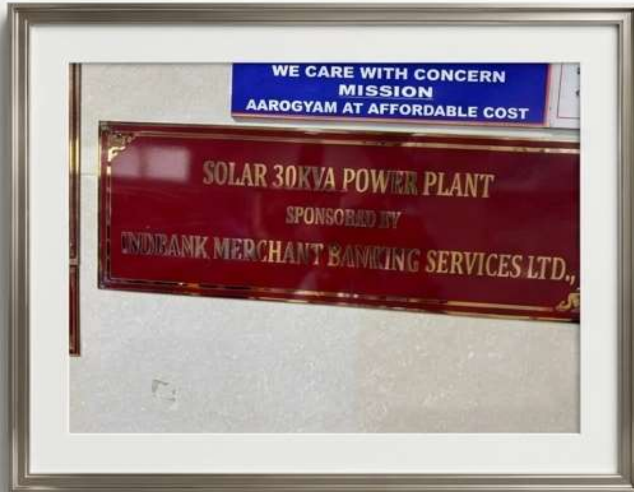
The permanent recognition plaque installed at the facility.